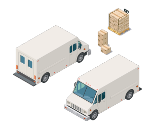
Mobile Asset Tracking